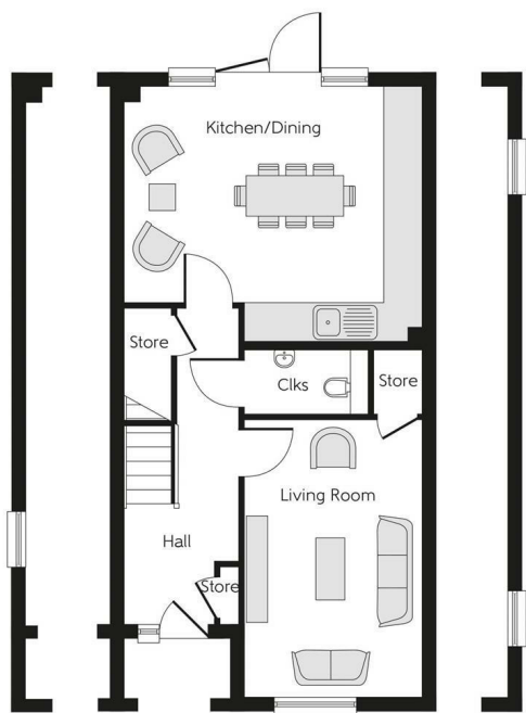
Variation to plots 188, 191, 197, 203, 206, 207 & 212